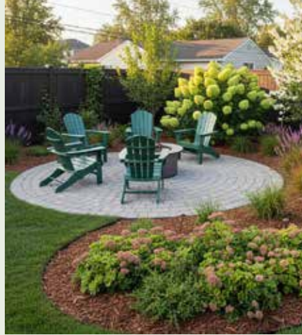
Including hardscaping and landscape areas in your yard reduces maintenance work.

One of the most effective ways to reduce yard work is to simply have less