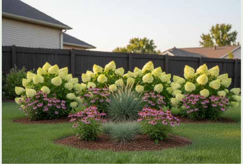
A landscape area that includes native plants hydrangea, purple coneflower, and ornamental grass.

Investing in home security isn't about living in fear; it's about living with the confidence that you have done everything possible to protect what matters most.